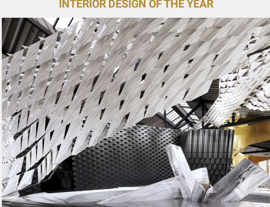
WOSA Sintered Stone Showroom, China The Volks Design Research & Consulting Ltd.