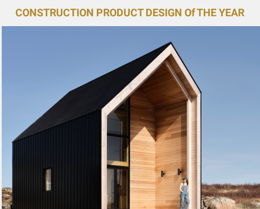
System 02, Canada The Backcountry Hut Company