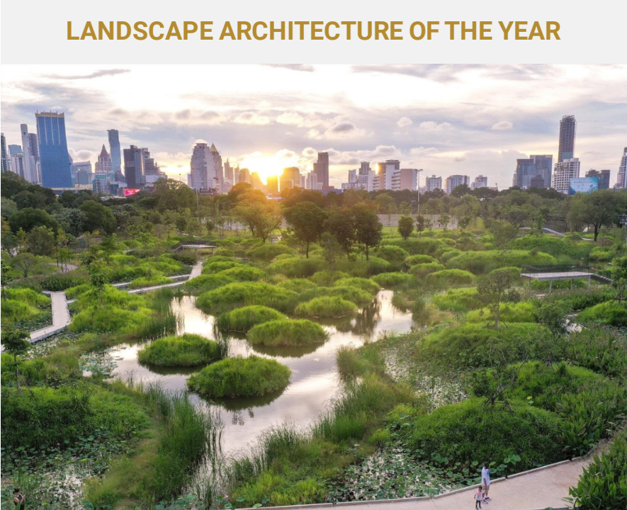
Benjakitti Forest Park, Thailand Arsomsilp Community and Environmental Architect + TURENSCAPE

Design: Arsomsilp Community and Environmental Architect; TURENSCAPE (Design Consultant) Location: Bangkok, Thailand Client: The Treasury Department (Ministry of Finance)